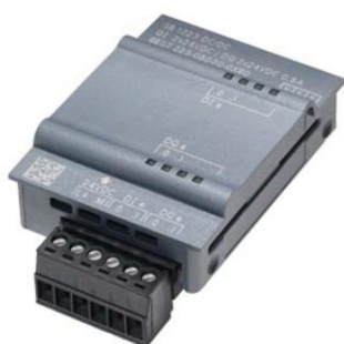
SIMATIC S7-1200, Digital I/O SB 1223, 2 DI/2 DO, 2 DI 24 V DC/2 DO 24 V DC