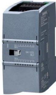
SIMATIC S7-1200, Digital output SM 1222, 16 DO, relay 2 A