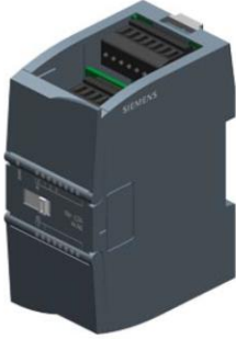
SIMATIC S7-1200, analog I/O SM 1234, 4 AI/2 AO, +/-10 V, 14-bit resolution or 0 (4)-20mA, 13-bit resolution